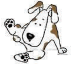
BECAUSE I CAN

10. How you act disgusted when I lick myself. Look, we both know the truth. You're just jealous.