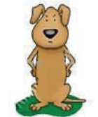
OBVIOUSLY, YOU HAVE ISSUES

6. The sleight of hand, fake fetch throw. You fooled a dog! Whooooo Hooooooooo what a proud moment for the top of the food chain.