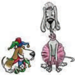
WHAT ARE YOU LOOKING AT?

5. Any haircut that involves bows or ribbons. Now you know why we chew your stuff up when you're not home.