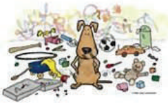
AND YOU HAD ME FIXED?!

7. Taking me to the vet for "the big snip", then acting surprised when I freak out every time we go back!