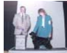
Shenanigans In Dark Shadows (Barnabus) Ch. Sterling's Darkfall x Ch. Shenanigans On Friday